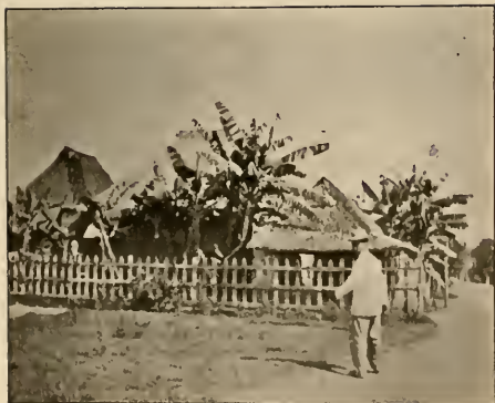
NIPA HUT AND BANANA TREES NEAR MANILA.